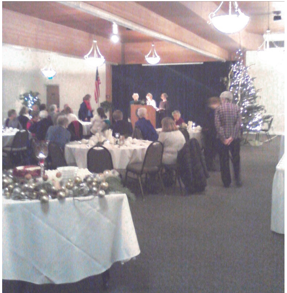
Guests gather to remember loved ones at the December Candlelight Service